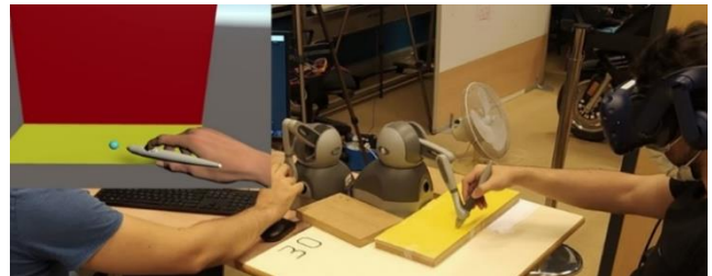
Figure 1: The VE (top left) and the experimental setup with the instructor (left) guiding the participant (right)

Objective measurements included distance estimation error (Euclidean distance between the centers of the moving sphere and the target sphere) and the pick and place completion time. Subjective measures included answers to the copresence (Qa) and the modality comparison (Qb) questionnaires.