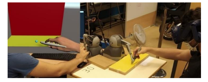
Figure 1: The VE (top left) and the experimental setup with the instructor (left) guiding the participant (right)

Objective measurements included distance estimation error (Euclidean distance between the centers of the moving sphere and the target sphere) and the pick and place completion time. Subjective measures included answers to the copresence (Qa) and the modality comparison (Qb) questionnaires.