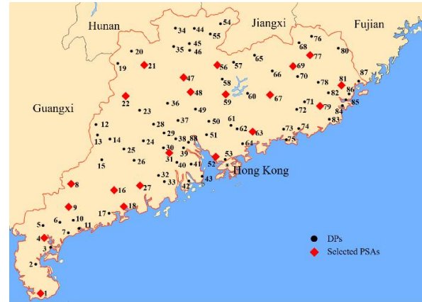
Figure 2. Candidate list of selected PSAs.

different model solutions. The computational results are demonstrated in Table 1.